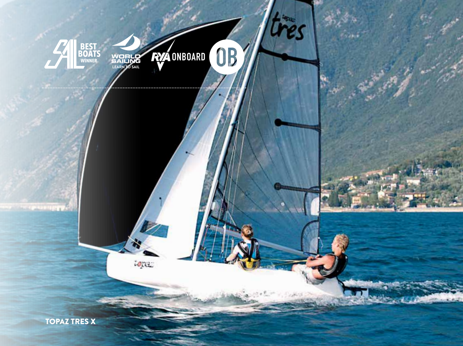
TOPAZ TRES X