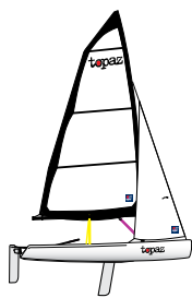
TOPAZ UNO RACE