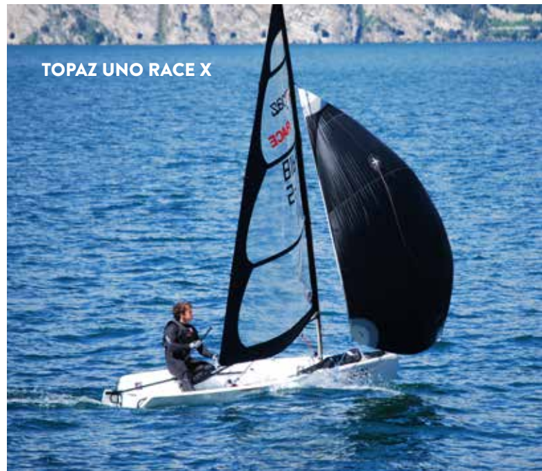
TOPAZ UNO RACE X

The TOPAZ is transformed into a two-person, three-sail flyer with a pedigree performance feel - yet no loss of the outstanding stability and vice-free temperament of the TOPAZ UNO options.