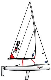
TOPAZ UNO Plus

Versatile choice of rig options that provide a sailing pathway from beginners basics through to complex techniques in manageable graduated steps.