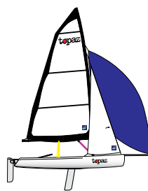
TOPAZ UNO RACE X